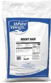
103443 WHITE WINGS BISCUIT BASE 5KG