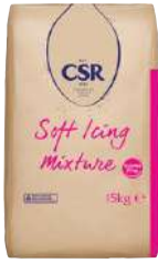
175043 ICING MIXTURE 15KG