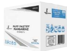
169484 GFIG PUFF PASTRY MARGARINE 1KG