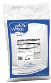
103447 WHITE WINGS CHEESECAKE FILLING 5KG