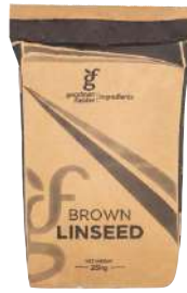
171340 GFIG BROWN LINSEED 25KG