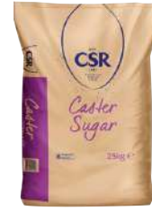
175042 CASTER SUGAR 25KG