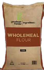
175653 GFIG WHOLEMEAL FLOUR 12.5KG