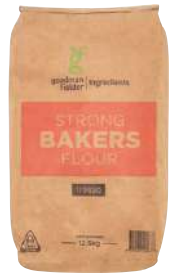
175650 GFIG STRONG BAKERS FLOUR 12.5KG