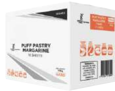
169483 GFIG PUFF PASTRY MARGARINE 1KG