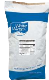
47041 WHITE WINGS UNIVERSAL DONUT MIX 20KG