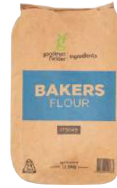
175649 GFIG BAKERS FLOUR 12.5KG