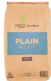
175651 GFIG PLAIN FLOUR 12.5KG