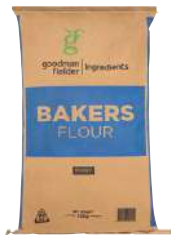
174987 GFIG BAKERS FLOUR 25KG