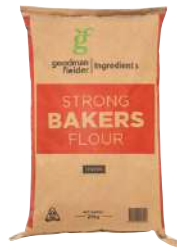
174986 GFIG STRONG BAKERS WHEAT FLOUR 25KG