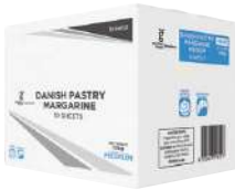
169482 GFIG DANISH MARGARINE 1KG