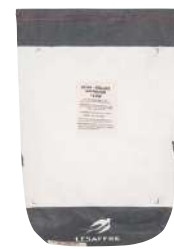
174991 DELUXE IMPROVER 15KG