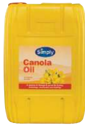
173078 SIMPLY CANOLA 20L