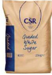
175654 GRADED WHITE SUGAR 25KG