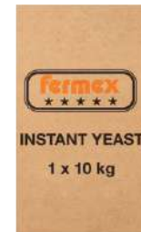
175004 FERMEX INSTANT DRY YEAST 10KG