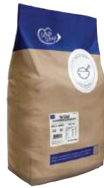
167260 WHITE WINGS ROLLED OATS 10KG