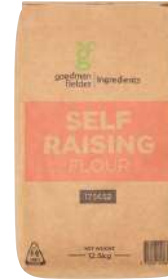
175652 GFIG SELF RAISING FLOUR 12.5KG