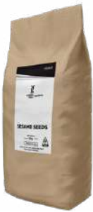
165803 GFIG SEEDS SESAME 15KG