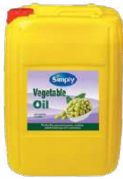
162756 SIMPLY VEGETABLE OIL 20L