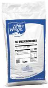
103445 WHITE WINGS NO BAKE CUSTARD MIX 5KG