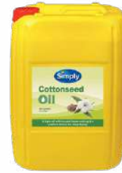
162954 SIMPLY COTTONSEED 20L