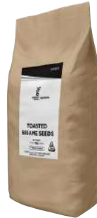
165804 GFIG SEEDS SESAME 15KG