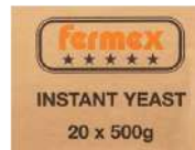
175003 FERMEX INSTANT DRY YEAST 500G